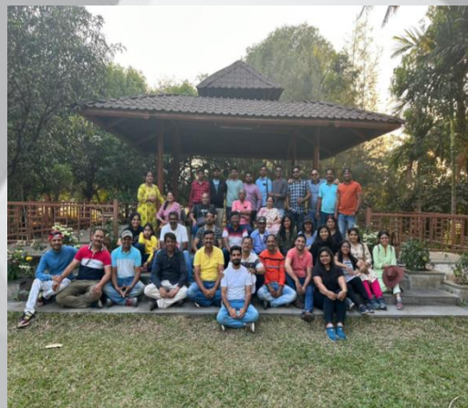
Picnic at Palm Wood Resorts