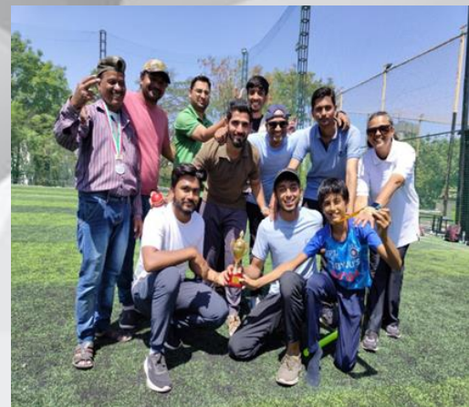
Sports Day: Cricket Winning Team

AEPPL would like to thank all our excellent customers for their continuous support. We look forward to serving you again in the future!